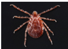
Asian Longhorned Tick