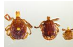
Lone Star Tick

Rushcreek Feed & Supply Company, Inc. 103 S. Broad St. Bremen, OH 43107 Phone: (740) 569-4105 Fax: (740) 569-9210